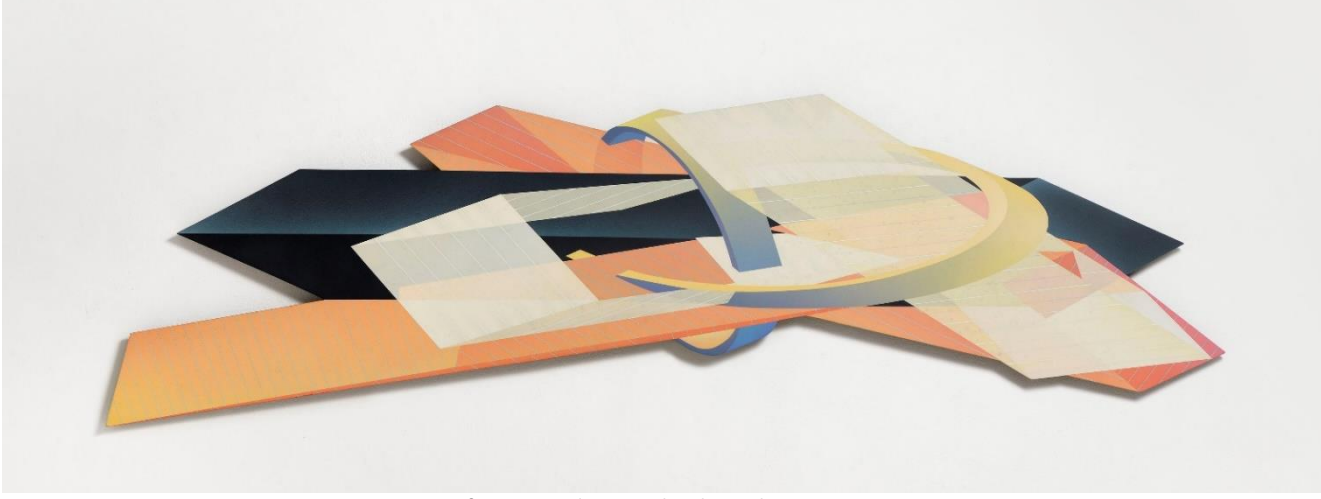
Gift, 2023; acrylic on poplar plywood, 48 x 173 cm

view the catalogue with an essay by Brendan Prendeville online